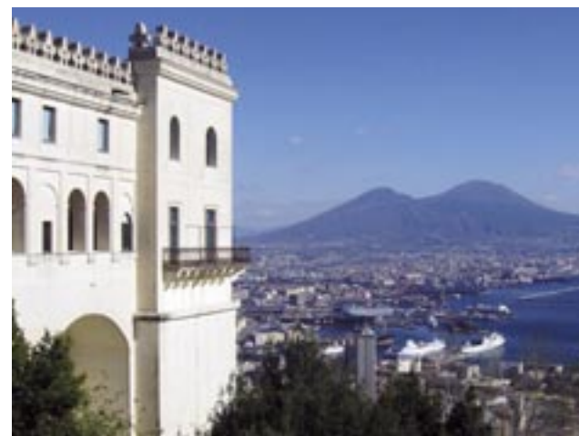
View from Castel Sant'Elmo

Collect your FREE copy of My Country Magazine - In & around Naples the first week of every month - See page 3 for some main distribution points