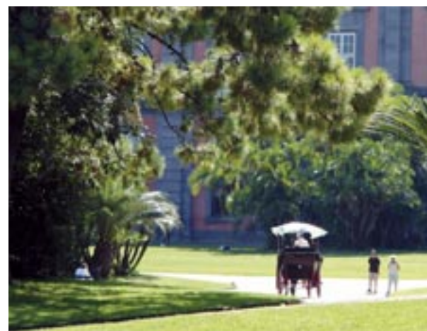
Museo e Real Bosco di Capodimonte

Collect your FREE copy of My Country Magazine - In & around Naples the first week of every month - See page 3 for some main distribution points