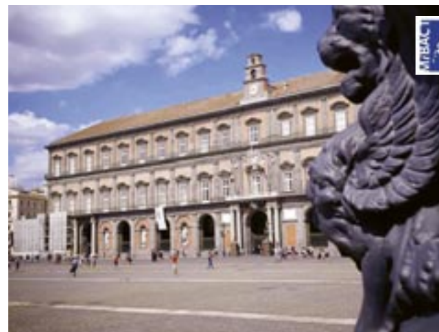
Palazzo Reale di Napoli

Please note: Access methods have been changed in compliance to anti-Covid 19 safety regulations. Organizational procedures, including timed entrance turns and sanitized environments will be in force to guarantee maximum public safety. Protective equipment (face masks) will be essential throughout all inside buildings and itineraries and information regarding social-distancing will be provided for the protection of all visitors and staff - until further notice. Stay Safe!