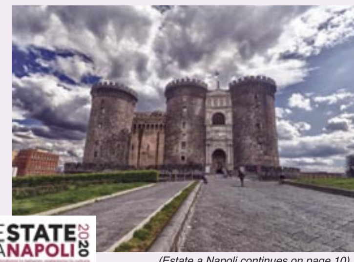
(Estate a Napoli continues on page 10)