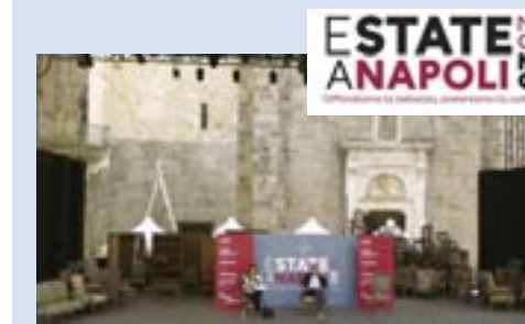
SUMMER IN NAPLES PAGES 8-10

DATES TO REMEMBER is back with two dates: Wishing on a Star on August 10th dedicated to St. Lawrence and the NOTTE DI SAN LORENZO arriving to the Capodimonte Music Festival with Double-Bill Concerts "Festival della Musica Popolare del Sud Italia" and August 15th - Ferragosto.