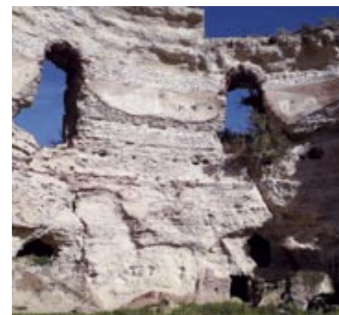
POZZUOLI PARCO IN MASCHERA P. 13

FOLLOW US & KEEP UPDATED! www.facebook.com/ paesemiomycountry